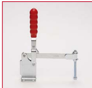
Vertical Handle Solid Bar