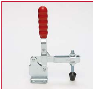
Vertical Handle U Bar