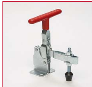
T Handle U Bar